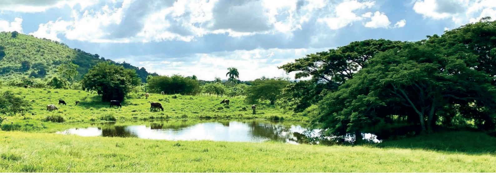
Salvaleon de Higuey, Dominican Republic.